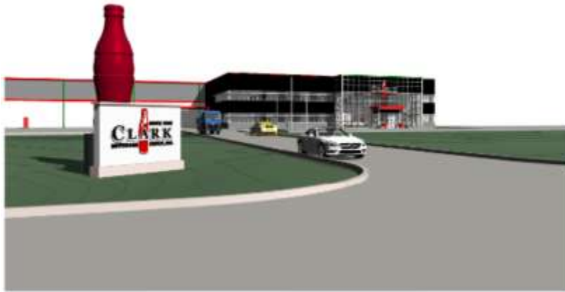
Figure 5 - View from Southbound Madison County Parkway towards the Site