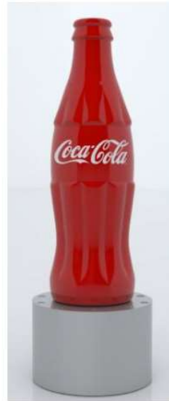
Figure 3 – Fabricated Coke Bottle Replica