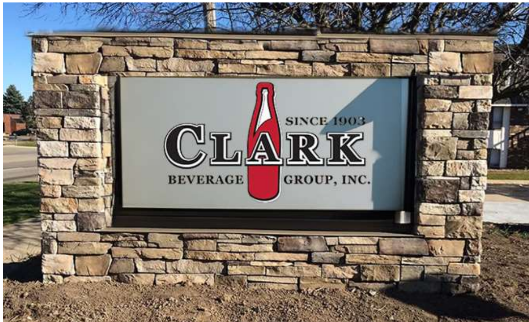
Figure 1 – Monument Sign