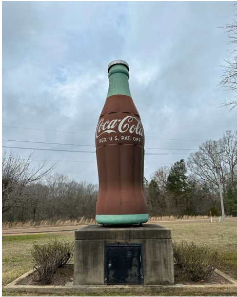
Figure 2 – Existing Coke Bottle Replica